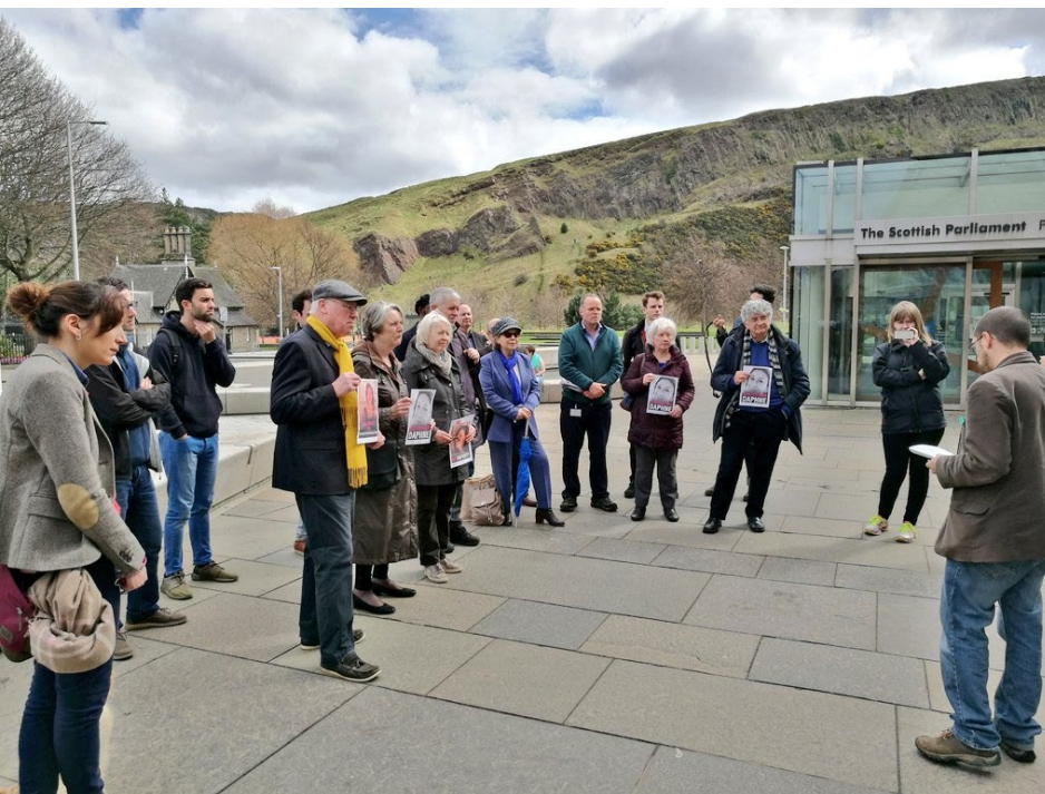
Vigil held at Scottish Parliament in honour of murdered Maltese journalist, Daphne Caruana Galizia

If you are organising an event, we would ask that you take care to be as inclusive as possible. This includes who you reach out to in terms of the audience, ensuring the venue is as accessible as possible and that the speakers represent the diversity of Scotland. Free speech is vital for different marginalised and protected communities to ensure they can take part in society and Scottish PEN believes it is vital that they should be able to take part in these conversations and events.