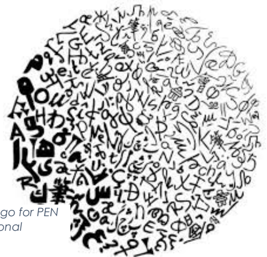
2 Early logo for PEN International

It believes that the necessary advance of the world towards a more highly organised political and economic order renders a free criticism of governments, administrations and institutions imperative. And since freedom implies voluntary restraint, members pledge themselves to oppose such evils of a free press as mendacious publication, deliberate falsehood and distortion of facts for political and personal ends.