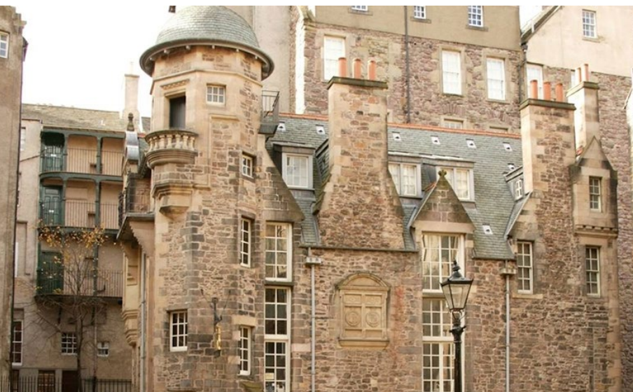
Writers Museum in Edinburgh that hosts the Scottish PEN offices